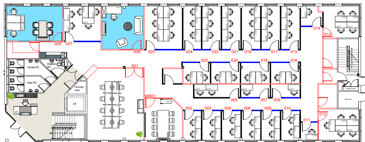
GROUND LEVEL FLOOR PLAN